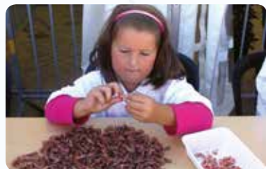
Shrimp Peeling