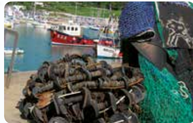
Lyme Regis, UK