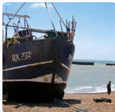
Hastings, UK

Globally, an estimated 75% of the world's fishing operations are artisanal or small-scale in nature and take place in coastal, inshore waters. These small-scale fisheries (SSF 1 ) are estimated to account for 80% of the European Community fishing fleet while representing 40% of the workforce in the fisheries sector for most Member States 2 . Taken together, SSF and IF generate a diverse range of inter-dependent livelihoods and provide significant indirect employment. Therefore, they make a vital contribution to the local economies, food security and trade as well as the social and cultural identity of Europe's coastal communities. In the UK, the vessels under 10 m represent 75% of the fishing fleet, while they have access to 4% of the fishing quota 3 . In France, 80% of the fishing fleet are vessels under 12 m 4 . Belgium's commercial fishing industry does not include SSF, yet fishing operations of vessels under 10 m in inshore waters are not subject to reporting or registration. Despite the significance of the inshore fleets, governments have largely ignored this sector and its importance, and its activity was left unrecorded. As a result, the importance of inshore fisheries has become invisible to the wider public, public services and authorities, and they are largely absent in national policy and decision-making. The time has come to reverse this situation.