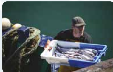
Le Guilvinec, France