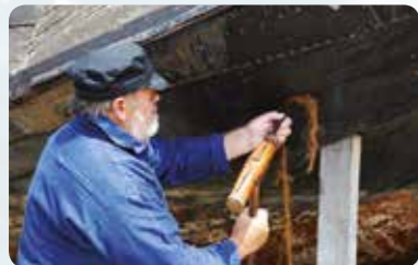
Shipyard