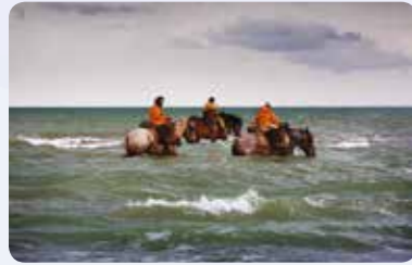
The horseback shrimp fishermen of Oostduinkerke