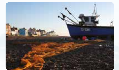
Aldburgh, Suffolk, UK (3)