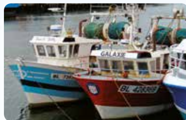
Boulogne, France

Across the EU Member States the terms artisanal, small-scale and shore-based fisheries have quite different and distinct meanings, and a plethora of terms is used to describe the diversity of artisanal and subsistence fishing, beachcombing, shellfish gathering, and small-scale fishing and gathering activities. There is no agreed definition for coastal or inshore fisheries in Europe. Different criteria are used in different Member States: vessel size, trip length, activity patterns, fishing gear and target species. The GIFS project used the following definition of inshore fisheries: vessels operating within 12 nautical miles (nm) off the coast and for a typical duration of 24 hours per fishing trip.