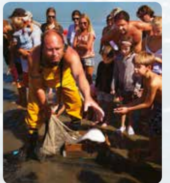
The horseback shrimp fishermen of Oostduinkerke