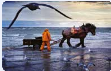
The horseback shrimp fishermen of Oostduinkerke (2)