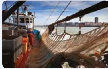
Dini O.62, Oostende