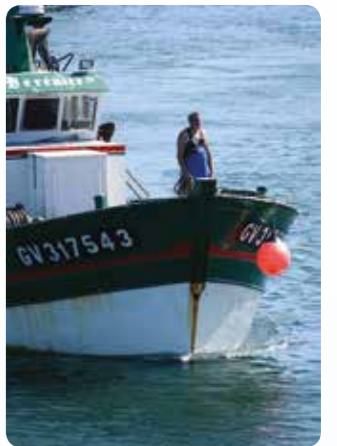
Le Guilvinec, France (2)

The purpose of governance structures imposed by national or EU authorities is often suspected to be the expansion of monitoring. The scale of bureaucracy in these structures repels fishers and other private sector members who feel the slow pace and prescriptive nature of the processing of grants and policy change are incompatible with the immediate pressing needs of the fishing industry.