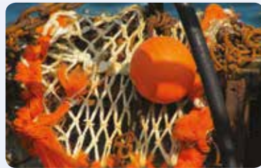
Barleur, France

Coastal or inshore waters are crucial to the life cycle processes of marine organisms: the hatcheries, nurseries and spawning and reproduction areas of most commercial fish species are located in coastal zones and estuaries. In most European fishing nations, coastal fisheries have played a historical role as a stable and reliable provider of food, resources and employment. For instance, commercial fisheries in Belgium's small strip of inshore waters provided over 20% of all landings over the last century, and even 60% of all molluscs and crustaceans landed by its commercial fleet.