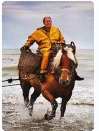
Oostduinkerke, Belgium