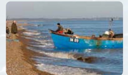
Sizewell, UK