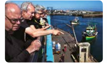
Le Guilvenec Tourists