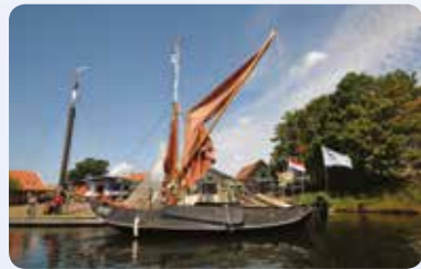
Hoogaars