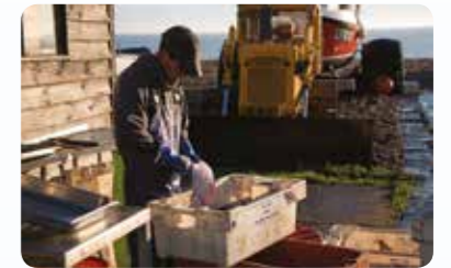
Aldburgh, Suffolk, UK