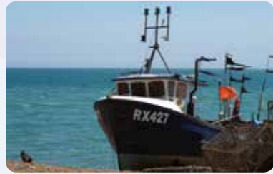
Hastings, UK