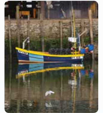
Looe, Cornwall, UK