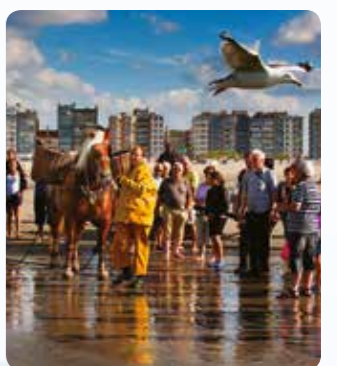
The horseback shrimp fishermen of Oostduinkerke