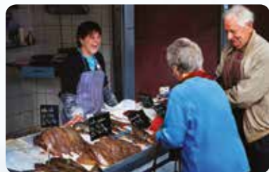
Fish Market