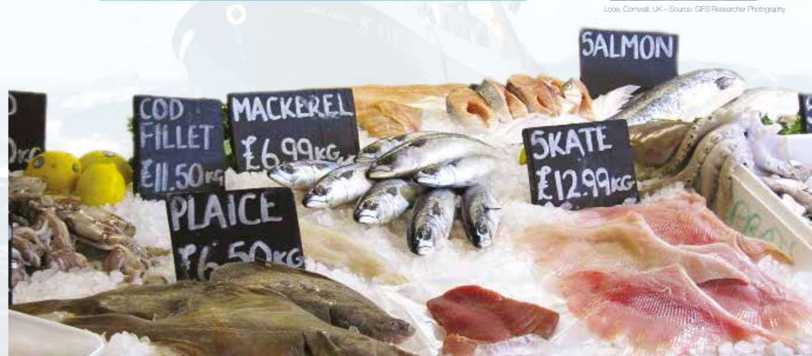
Whitstable, UK (2) – Source: GIFS Researcher Photography