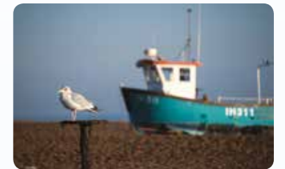
Aldburgh, Suffolk, UK (2)